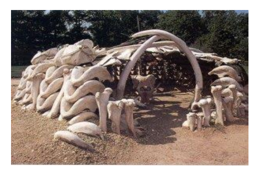
Pic. 3 A shelter found in Mezin, in Ukraine<sup>iv</sup>

In addition to constructing complex shelters, these early people dressed in fur clothing. Their custom of sprinkling ochre on the bodies of their dead before burial indicates that they had complex religious beliefs.