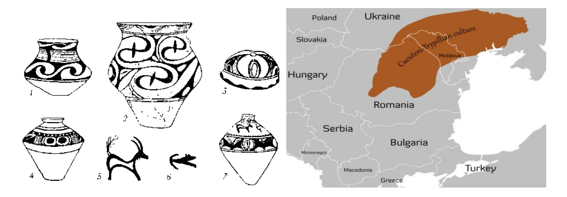
Pic. 5 Trypillian culture vi

In the Eastern European plains the oldest farming culture, the Cucuteni-Trypillian developed. This culture extended from the Carpathian Mountains to the Dniester and Dnieper regions, centered on modern-day Moldova and covered western Ukraine and northeastern Romania.