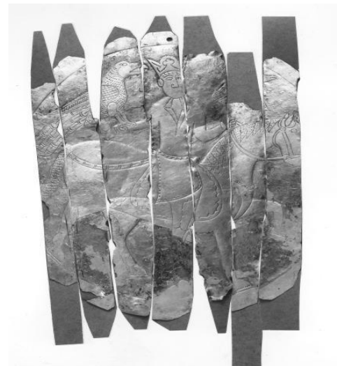
A horseman with a bird on his arm in Yamal Peninsula

A number of niello pieces dating to the 13 th and 14 th centuries, displayed a mix of decorative figures. A common image found by archaeologists on a number of items is horseman with a bird on his arm. These decorative plates has been discovered in the Perm Kama (16 plates), in the Komi Republic (5 plates), and on Vaigach Island (a single