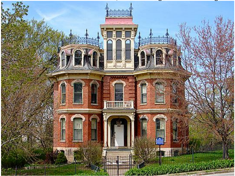
Sharon House, Davenport, Iowa http://www.livingplaces.com/architecturalstyles/li/Second_Empire-540x405.jpg

Second Empire: Popular during the middle part of the 19<sup>th</sup> century, "Second Empire" adopted French architectural details such as the mansard roof. The message communicated by the design was that of a connection to the cultural values of the French, and an assumed sophistication. In addition to the use of mansard roofs and rounded windows, there was a great deal of wrought iron.