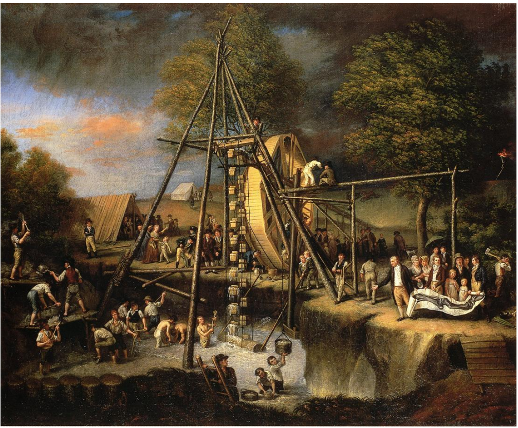
Charles Willson Peale. "The Exhumation of the Mastadon" (1806). (source: wikipedia)

Benjamin Rush : One of the Founding Fathers of the United States, Rush was a practicing medical doctor who was one of the first to believe that mental illness is a disease of the mind and has neurological origins. Rush wrote extensively to support a scientific approach to mental illness and to counter the belief that mental illness was caused by the "possession of demons."