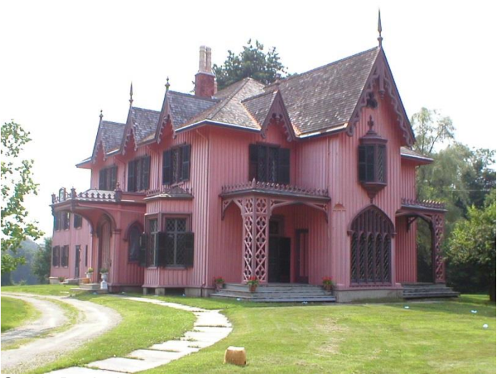
Gothic Revival https://architecturestyles.org/gothic-revival/

Second Empire: Popular during the middle part of the 19<sup>th</sup> century, "Second Empire" adopted French architectural details such as the mansard roof. The message communicated by the design was that of a connection to the cultural values of the French, and an assumed sophistication. In addition to the use of mansard roofs and rounded windows, there was a great deal of wrought iron.