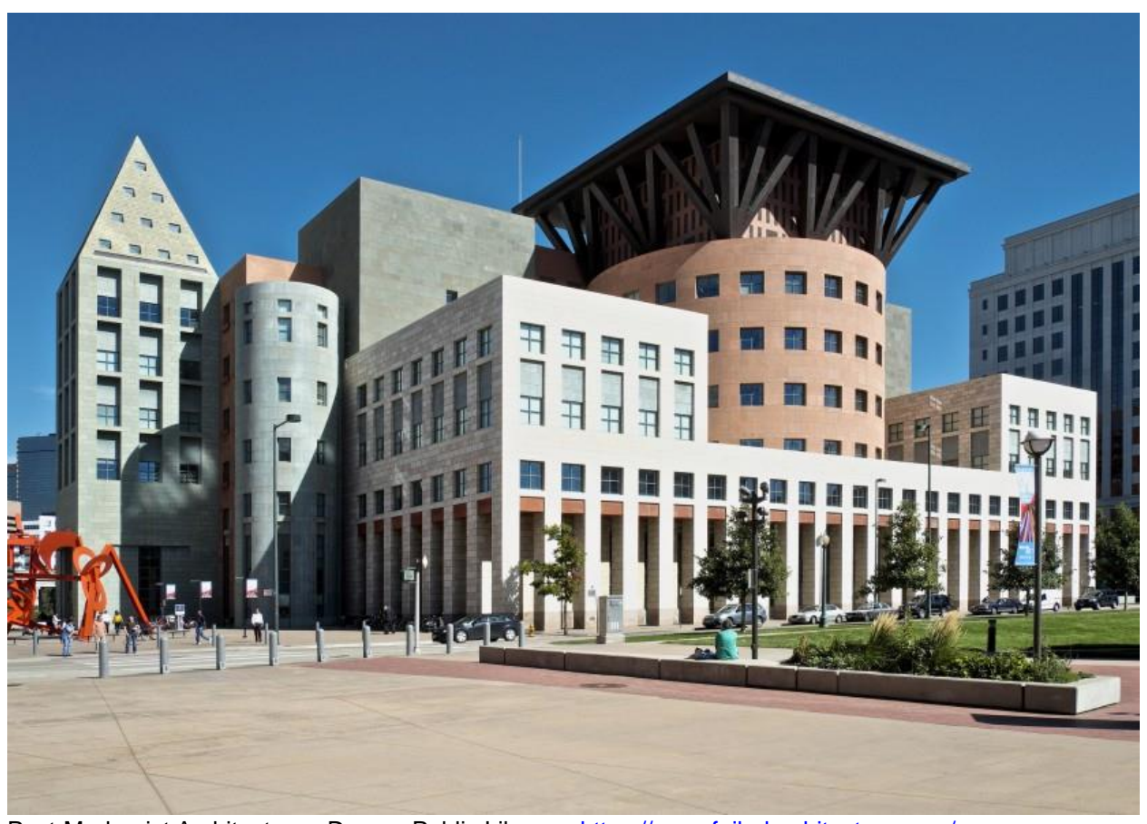
Post-Modernist Architecture - Denver Public Library - <a href="https://www.failedarchitecture.com/wp-content/uploads/2015/12/denver-830x587.jpg">https://www.failedarchitecture.com/wp-content/uploads/2015/12/denver-830x587.jpg</a>