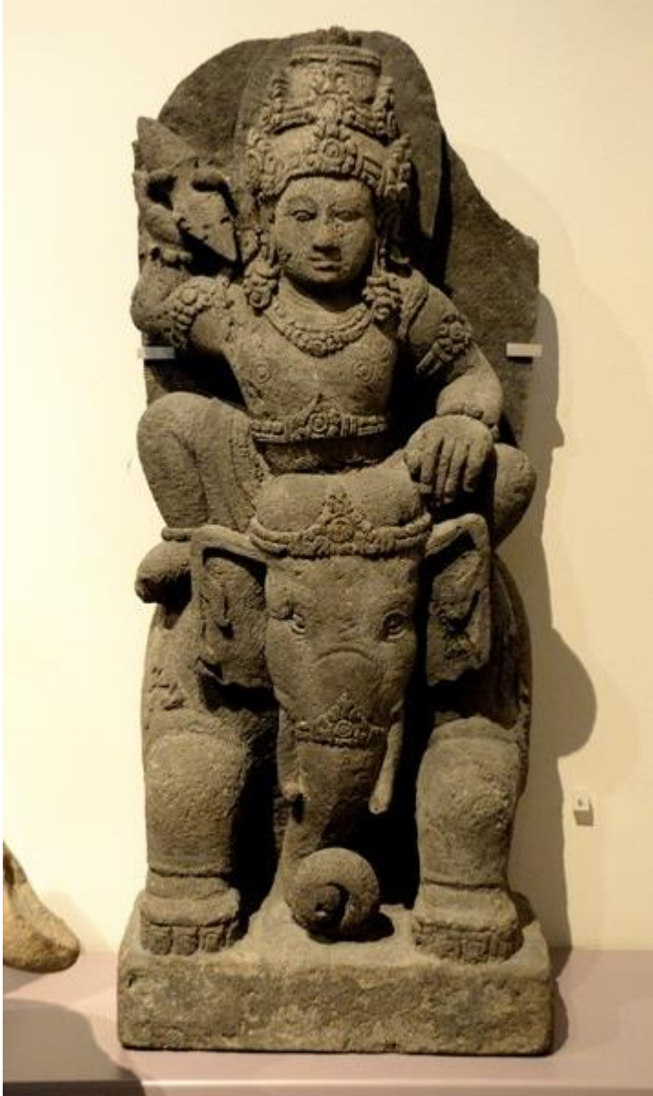
(Indra riding his elephant and holding his thunderbolt, Java c. 900 CE)