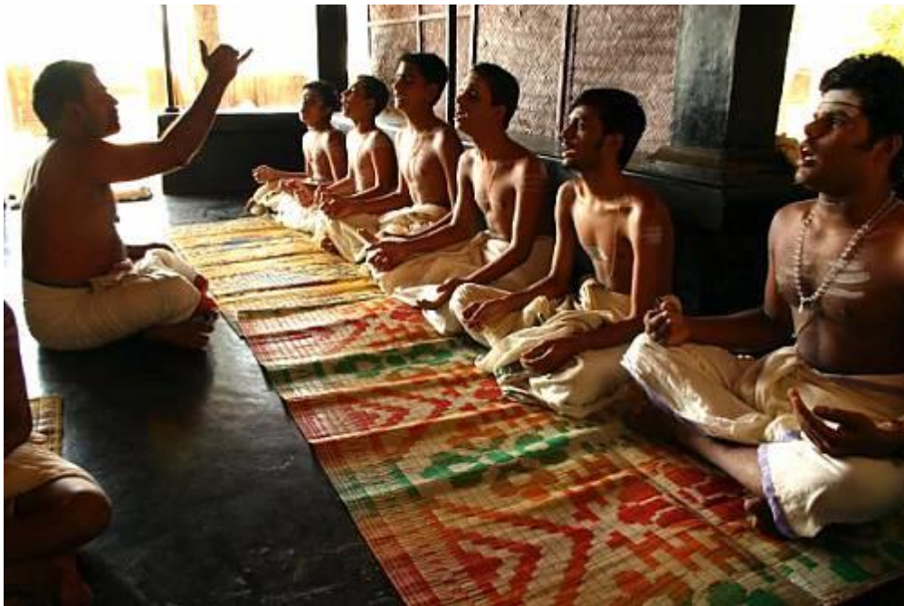
(young men instructed in Vedic chanting, Kerala, date unknown)

Caste system A third significant story in the Rig Veda is the so-called 'creation of man,' which explains the four-fold division of Indian society, which over time evolved into the caste system. In its original form, however, this story is less about sociology and more about the power of ritual sacrifice. The 'cosmic man' who is dismembered is called purusha (lit. 'man'), which seems to be an anthropomorphic combination of various deities and also a microcosmic representation of the world. The sacrifice of the cosmic man is described as a template for the ritual sacrifices performed on earth by priests. This is another example of the Vedic principle of correspondence, that the invisible is linked to the visible and that the vast cosmos can be replicated in a human being. Ever since the late 18 th century, however, when foreign scholars began to translate the Rig Veda , the story has been seized on as an explanation for caste. And there is no doubt that the metaphor of dismembering the primal man did have a social meaning. This is clear when we read: 'His mouth was the Brahman, his arms were the Rajanaya [Kshatriya caste], his thighs the Vaisya [caste]; from his feet the Sudra [caste] was born.' Again, as with many Vedic myths, this creation story has close parallels with the sacrifice of a giant, primordial man ( ur mensch ) in German and Norse mythology.