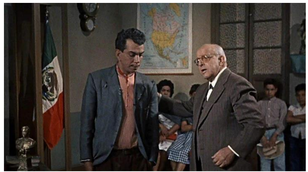
Inocencio (Cantinflas) enrolls in kindergarten. He is ashamed that he cannot read or write, but he is determined. Notice the Mexican flag in the background. Literacy is viewed with great probity, and it is considered a patriotic act to develop individual human capital as well as society at large.