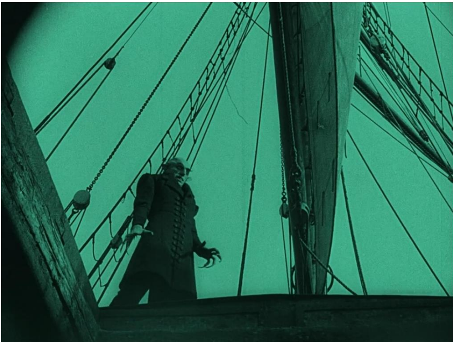
An extreme low angle shot, indicating that Nosferatu is now in control of the ship.