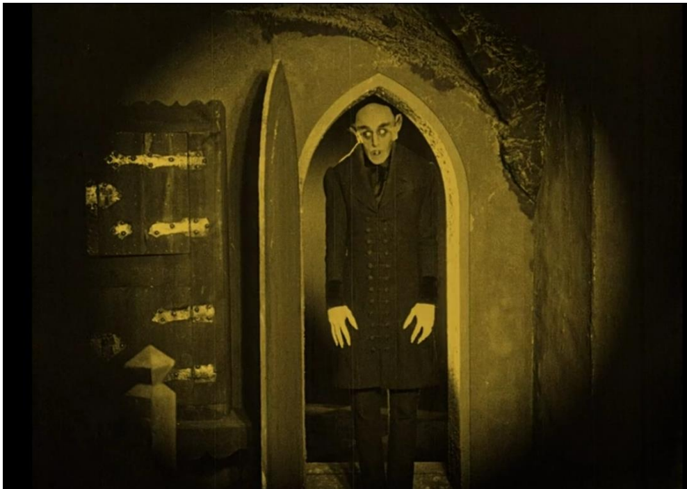
An example of the circular vignette, often accentuated by doorframes, arches, windows, and other framing devices.

Nosferatu participates in several cinematic traditions. The first is obviously the silent film tradition, characterized by what we might call "overacting": pantomime-style gestures, exaggerated facial expressions, and repeated motions. Scenes are short and are focused through vignette framing, which also aids in easy and frequent transitions. Because of the lack of audible speaking, scenes are interrupted by intertitles that provide narration, dialogue, and documents. Interestingly, the intertitles are presented in the first person, an unknown recipient of the tale who knows more than its characters and imparts that knowledge to the audience. It is suggested that the narrator heard this story directly from Professor Bulwar, one of the minor characters involved. Though the film is referred to as black-and-white, its plates are actually tinted in different colors to distinguish between scenes and settings.