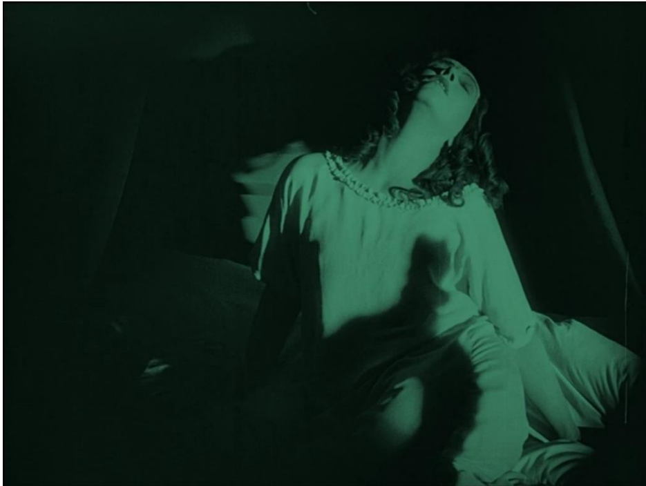
The irresistible shadows that can transgress boundaries physical form cannot.