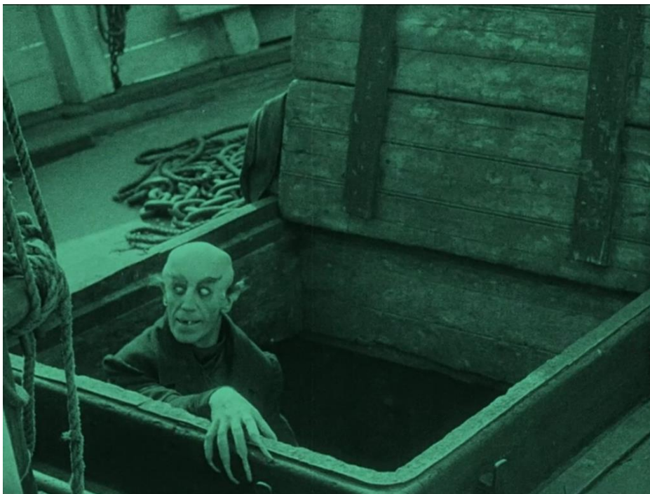
Stop motion animation was used to make this door open by itself, a demonstration of Nosferatu's power.

German Expression often includes surrealist or impossible sets. Nosferatu is subtle in this regard, as it takes advantage of natural outdoor settings and lavish homes, mostly bedrooms. It relies more on fantasy and superstition than artificiality to create a sense of disruption. Its surrealism appears in makeup and costume, turning Count Orlok himself into a surreal character, one who also engages in surrealist impossible movements, inhuman jerky speeds, seeming to float or levitate. This effect is achieved through early stop action animation and speed-ramping. These effects are also used for a carriage that moves without its wheels turning and doors that open on their own, as if by magic. The journey taken by the carriage is also made uncanny through the use of film negative effects, creating a duality that echoes the one created through shadows and windows, which are used to produce visually disorienting instances in which characters look across at, down on, or up at each other. Instead of unexpected angles in the architecture, Nosferatu utilizes unexpected camera angles. Count Orlok in particular is shown through extreme low-angle shots that have become renowned in cinematic study, as well as a mix of wide-angle and close-up shots that create anticipation and anxiety.