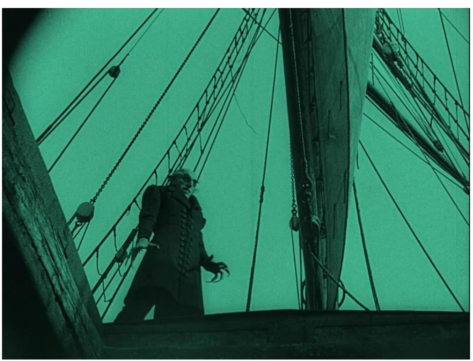
An extreme low angle shot, indicating that Nosferatu is now in control of the ship.