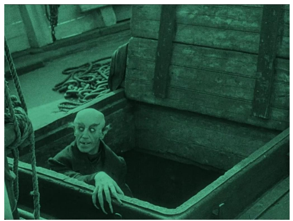
Stop motion animation was used to make this door open by itself, a demonstration of Nosferatu's power.

German Expression often includes surrealist or impossible sets. Nosferatu is subtle in this regard, as it takes advantage of natural outdoor settings and lavish homes, mostly bedrooms. It relies more on fantasy and superstition than artificiality to create a sense of disruption. Its surrealism appears in makeup and costume, turning Count Orlok himself into a surreal character, one who also engages in surrealist impossible movements, inhuman jerky speeds, seeming to float or levitate. This effect is achieved through early stop action animation and speed-ramping. These effects are also used for a carriage that moves without its wheels turning and doors that open on their own, as if by magic. The journey taken by the carriage is also made uncanny through the use of film negative effects, creating a duality that echoes the one created through shadows and windows, which are used to produce visually disorienting instances in which characters look across at, down on, or up at each other. Instead of unexpected angles in the architecture, Nosferatu utilizes unexpected camera angles. Count Orlok in particular is shown through extreme low-angle shots that have become renowned in cinematic study, as well as a mix of wide-angle and close-up shots that create anticipation and anxiety.