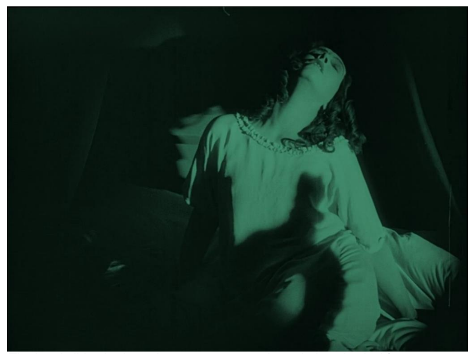
The irresistible shadows that can transgress boundaries physical form cannot.