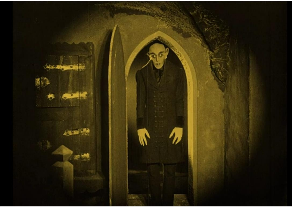
An example of the circular vignette, often accentuated by doorframes, arches, windows, and other framing devices.

Nosferatu participates in several cinematic traditions. The first is obviously the silent film tradition, characterized by what we might call "overacting": pantomime-style gestures, exaggerated facial expressions, and repeated motions. Scenes are short and are focused through vignette framing, which also aids in easy and frequent transitions. Because of the lack of audible speaking, scenes are interrupted by intertitles that provide narration, dialogue, and documents. Interestingly, the intertitles are presented in the first person, an unknown recipient of the tale who knows more than its characters and imparts that knowledge to the audience. It is suggested that the narrator heard this story directly from Professor Bulwar, one of the minor characters involved. Though the film is referred to as black-and-white, its plates are actually tinted in different colors to distinguish between scenes and settings.