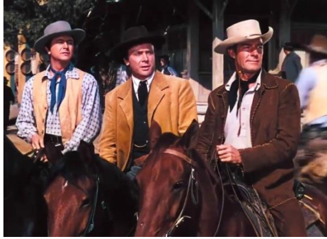
(The three leads Blake (Robert Young), Creighton (Dean Jagger) and Shaw (Randolph Scott) in town to buy horses)