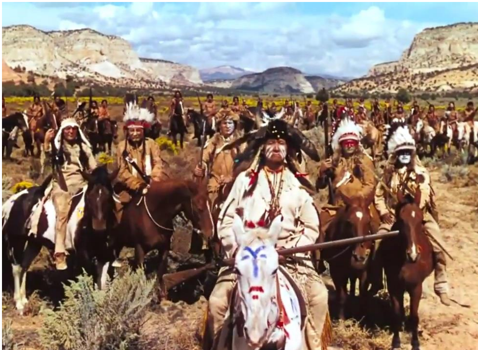
(The fake and real Indians; the chief's son is amused by the sextant)