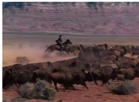
(Opening shots of the vast space and a lone rider)