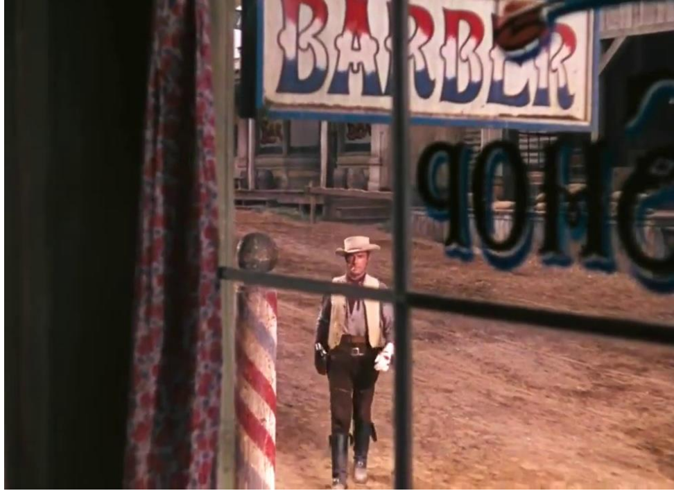
(Examples of Cronjager's cinematography)