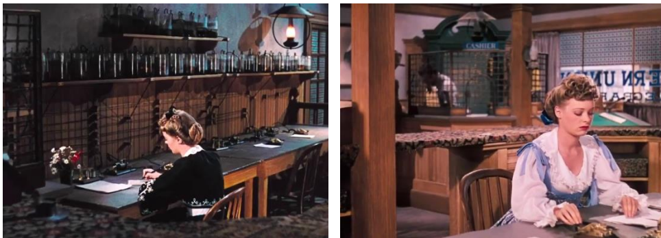
(Sue Creighton is a telegraph machine operator. She anticipates the phone company switchboard operators of Lang's The Blue Gardenia )