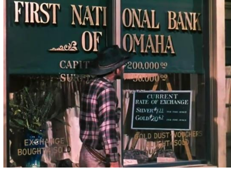
(Brief glimpses of town life: A woman gets her shoes polished by a Black boy while two older men gawk at the scene; the bank's window displaying rate of exchange for precious metals recalls Lang's comparable visualization of market economy in Dr. Mabuse the Gambler and M )