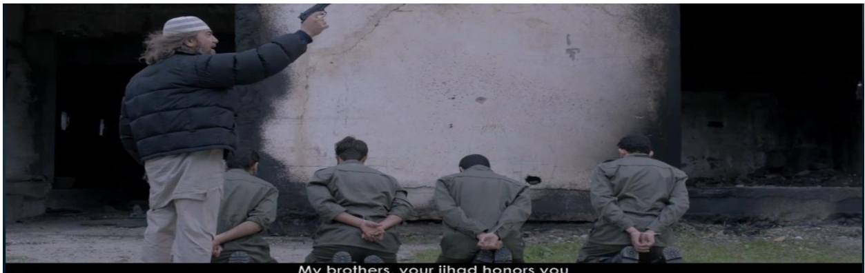
My brothers, your iihad honors you