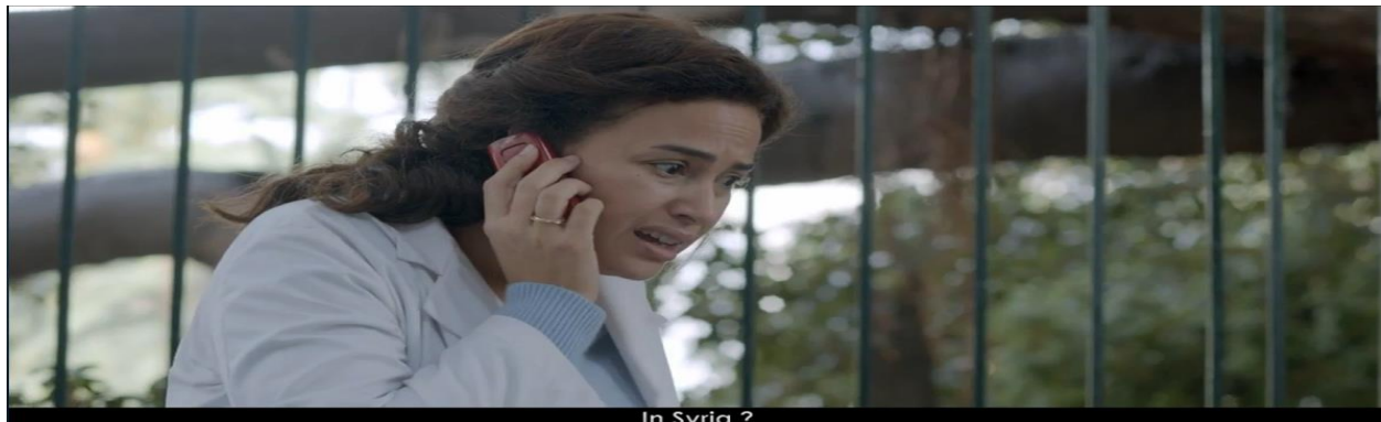
In Syria ?