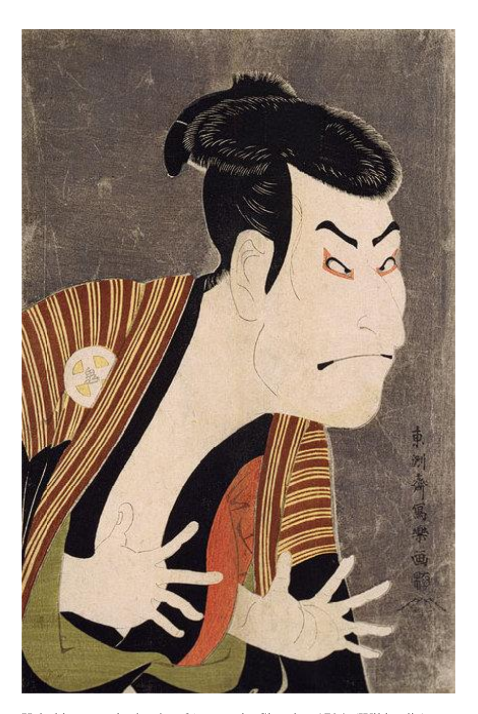
Kabuki actor print by the ukiyo-e artist Sharaku, 1794