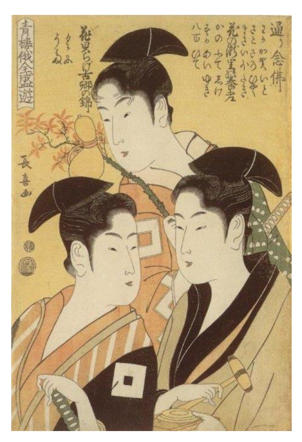
Ukiyo-e print featuring popular geisha, circa 1800