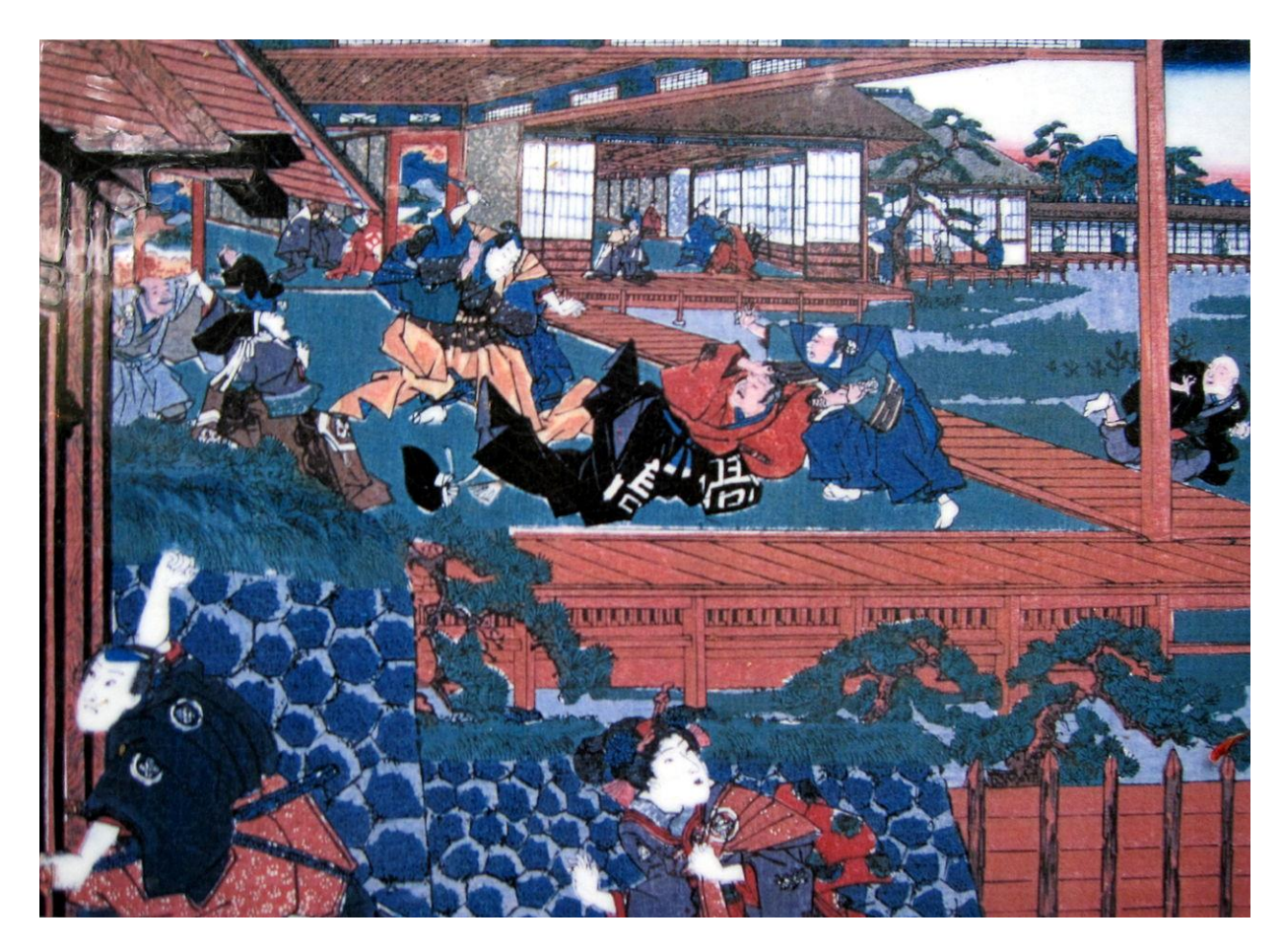
Woodblock print depiction of a dramatic scene from the Chûshingura vendetta tale.