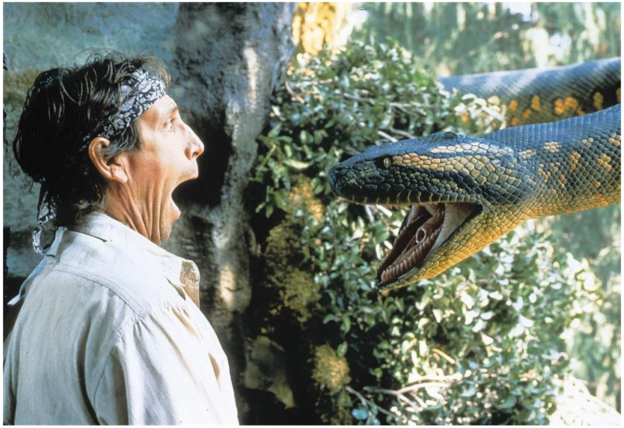
Westridge and the Anaconda