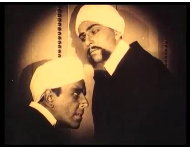
(Hoog finds a map—one of many to come in Lang films—of the Falkland Islands hidden in the portrait painting of the diamond king's pirate ancestor; Indian spies join Chinese characters as tokens of malicious foreigners)