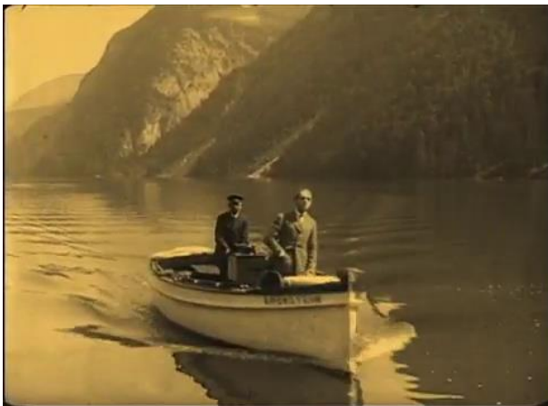
(First casting of Rudolf Klein-Rogge in a Fritz Lang film—which also happens to be the one that has many outdoor scenes shot beautifully; Georg mistakes Irmgard to be the Our Lady of the Snow statue gliding downhill)