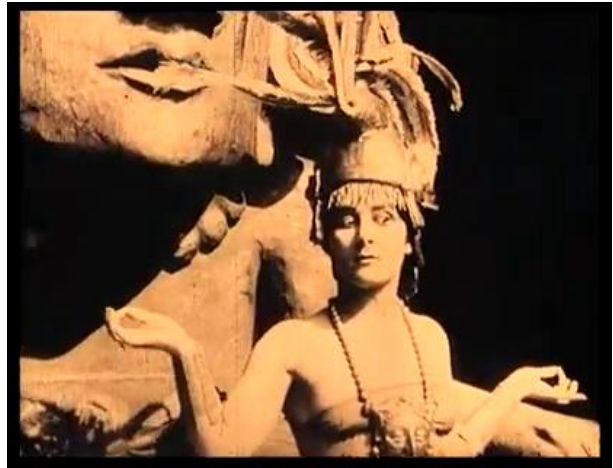
(The adventurer Kay Hoog makes use of his well-stocked library for research; Lil Dagover plays the Inca princess)