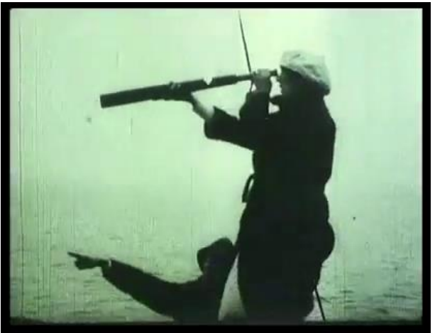
(The villainess Lio Sha oversees the field operations of the Spiders and sports a flapper style)