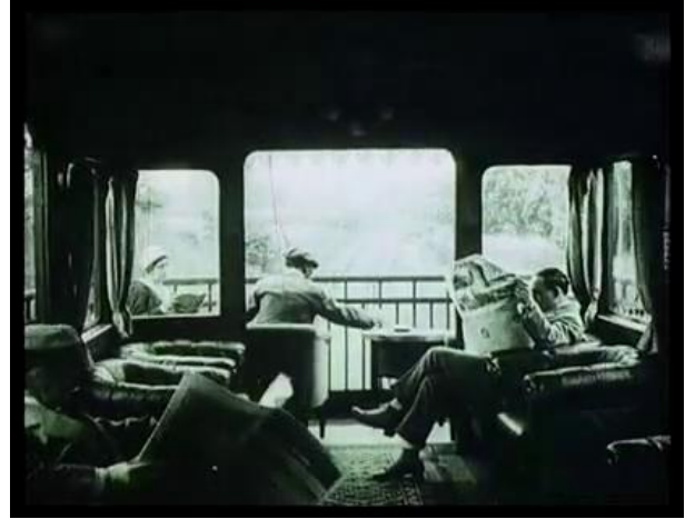
( Spiders has scenes that take place in the modern city, but action mostly takes place in exotic lands; a train's observation car in Spiders . Lang would use trains often in his later films)