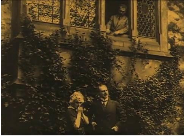
(Radical philosopher Georg Vanderheit tells Irmgard that he would contradict his own convictions if they got married—and his brother John eavesdrops; Georg begins to live as a hermit in the mountains)