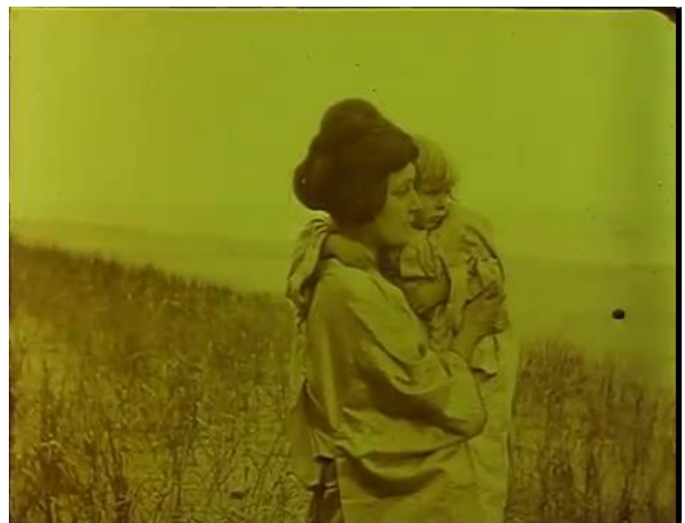
(Anderson with his European wife; O-Take-San with her child, waiting in vain for Anderson's return)