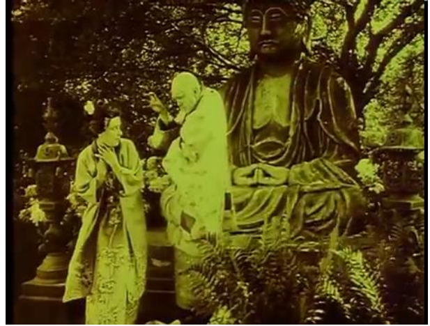
(Elaborate sets of Harakiri: O-Take-San, with her father at home; cornered by the monk at the temple)