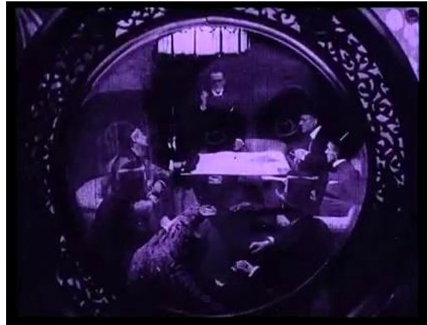
(A mirror doubles as a television screen and Lio Sha uses it to view the meeting of the Spiders committee—this scene comes eight years before a similar technology makes an appearance in Metropolis for the master of the city to surveil the workers)