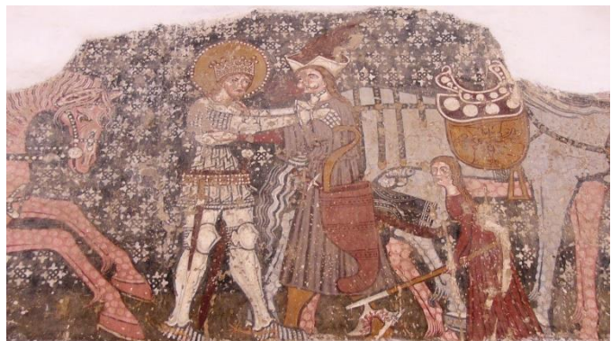
Fresco depicting the king of Hungary, Saint Ladislaus' battle against the Cuman warrior, Dârjiu, Romania

In a fresco this bow was depicted in the Cuman warriors bag.