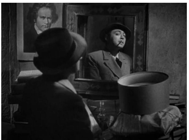
(Raskolnikov’s knees shake when he is summoned to the police station—while his idol, Napoleon, is watching over his shoulder; his confidence boosted, Raskolnikov dresses up and prepares to conquer the world. His second idol Beethoven’s portrait is hanging by the mirror)