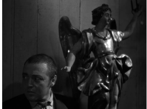
(Sonya guides Raskolnikov with her “wholesome purity”. 13 Audiences would have been previously accustomed to the glamorous visualizations of von Sternberg. Even though Sonya’s social position is anathema to glamour, her visual portrayal is striking as per von Sternberg style; Raskolnikov has delusions of grandeur)