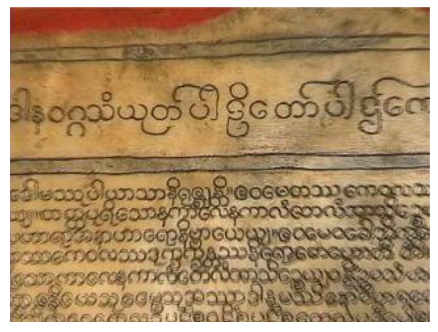
(Pali text written in Burmese script on palm-leaf, date unknown)

In addition to these recorded texts, the Pali Canon also stimulated an extensive commentarial literature, much of which is still untranslated and some of which has not survived. Other early Pali texts also exist outside the canon. For example, the famous compiler of the canon, Buddhaghosa, wrote Vissuddimagga ('Path of Purification'), which is a magisterial commentary and explanation of Buddhist doctrine with an emphasis on meditation. Because it introduced new ideas, however, it is not considered canonical.