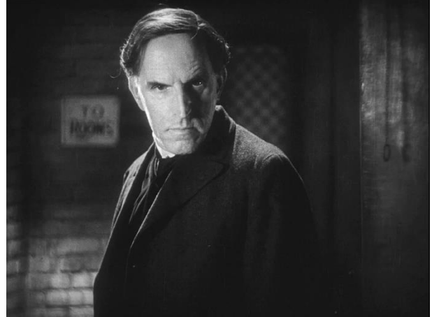
“Save your soul and money, come to Hymn-Book Harry”; the pastor advertises his services with a flyer on the pianola of the Sandbar – the dignified looking pastor is played by Gustave von Seyfertitz.