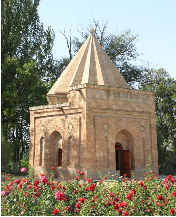
Babaji Khatun Mausoleum