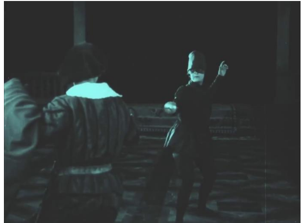
(Fiametta instructs the Moor about stabbing Girolamo with the poisoned dagger; with her rapier, she confronts the masked man, whom she believes to be Girolamo—he turns out to be her lover)