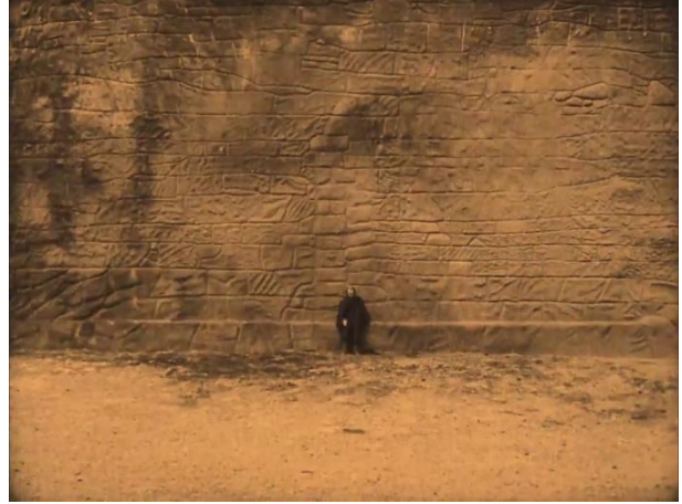
(Bernhard Goetzke plays the Weary Death; the massive wall with no entrance puzzles the townsfolk)