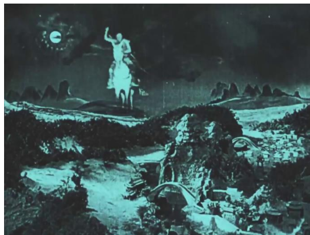
(The emperor's archer riding his horse in pursuit of the lovers—the rider is superimposed on a matte painting)