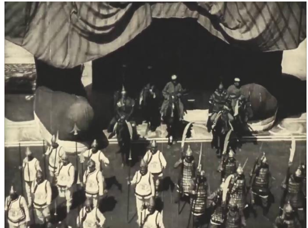
(The magician A Hi creates a miniature army to impress the emperor)