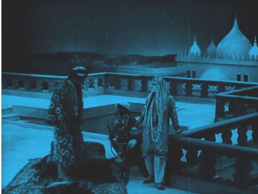
(The Arabian Nights episode, Zobeide and her brother)