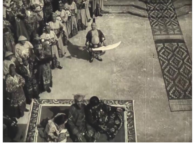
(The magician and his assistants travel to the emperor's palace on a flying carpet. Douglas Fairbanks bought the rights to the film to use the special effects in The Thief of Baghdad ).