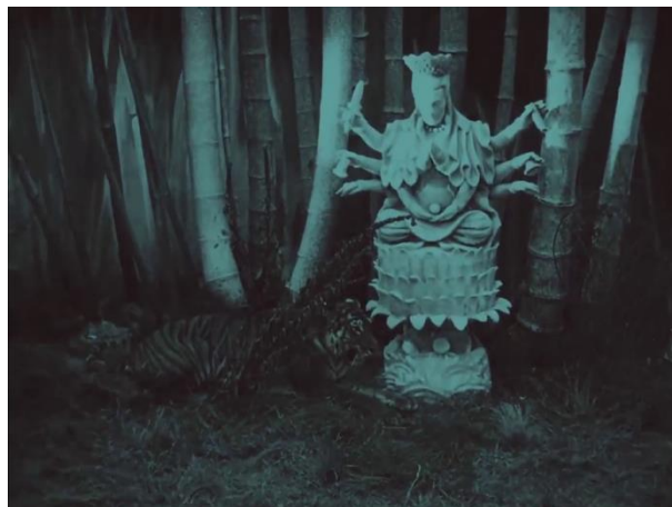
(Magician's assistants manage to evade the emperor's troops but the archer finally catches up with them. When all else fails, Tiao Tsien transforms herself into a Bodhisattva statue and her lover Liang into a tiger—which doesn't fool the archer)