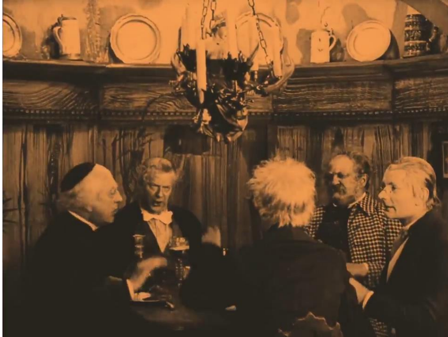
(The elders of the Flemish town—the scene anticipates the pub buddies discussing the murders in Fritz Lang's M )