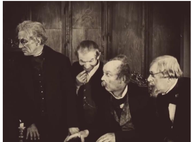
(Town council is initially reluctant to sell the land adjacent to the cemetery but the Weary Death's offer of ample gold changes their mind)