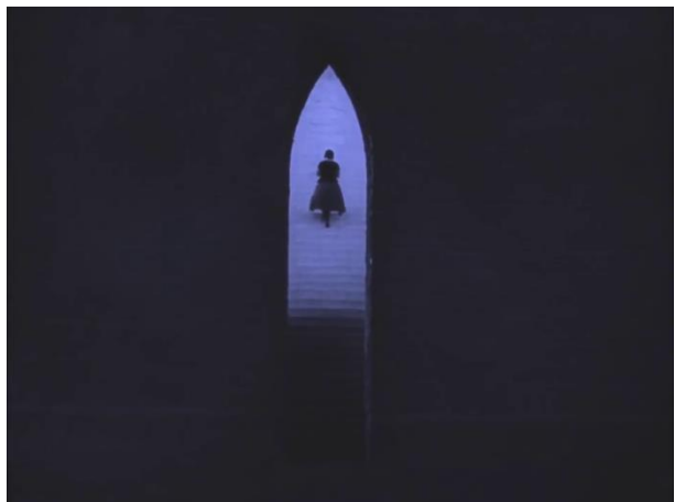
(Semi-transparent apparitions walk towards the wall—among them are children, a king, a nun; the moment the Maiden attempts to commit suicide, she enters the Weary Death's realm from a flight of stairs)