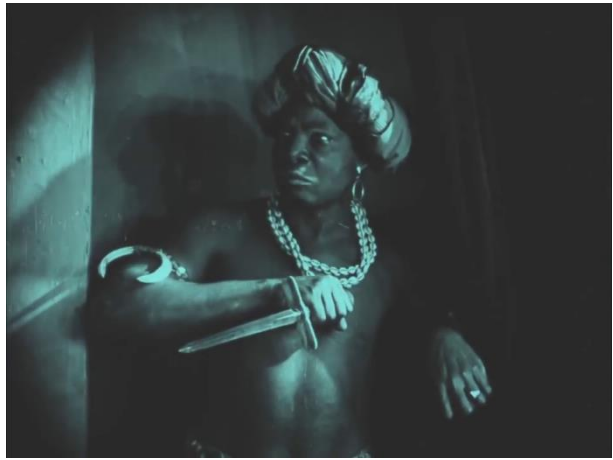
(In legendary China, the Weary Death is seen again as the emperor's archer; in Venice, the actor appears only at the very end, when the Fiametta's servant the Moor gets transformed into the cloaked stranger)