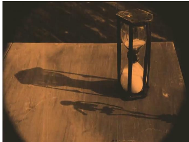
(Memento mori: the beer mug turns into hourglass as a skeleton's shadow appears)