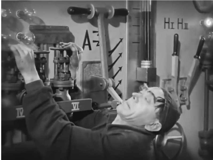
(At the Machine chamber of Metropolis, workers desperately struggle to keep up with the machines. Fritz Lang regular actor Georg John appears as the worker who causes the explosion)