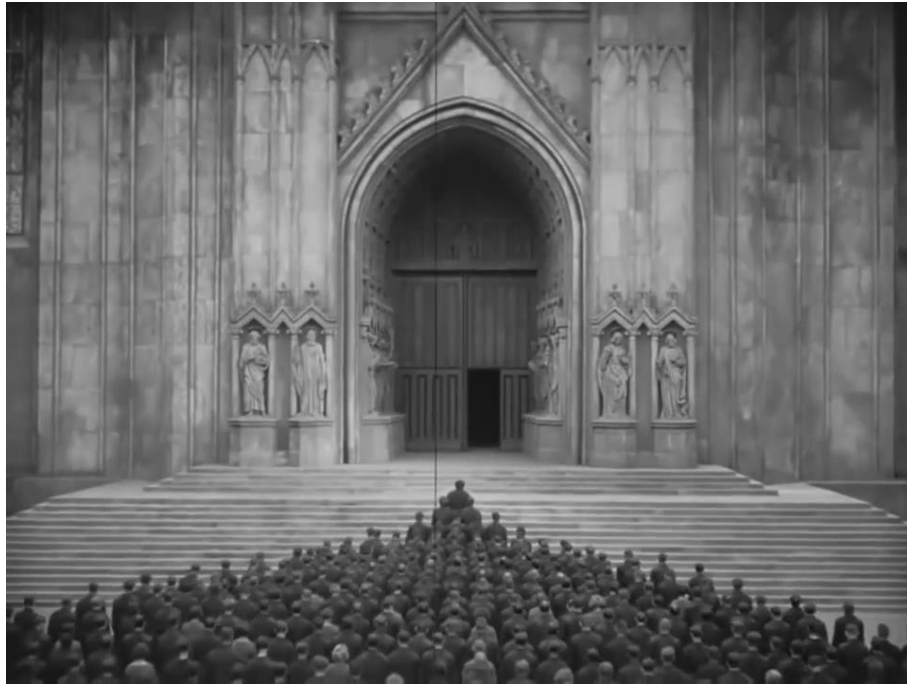
(Finale brings political—and geometric—order)

1 Leedom, Sara. "Fritz Lang's Metropolis: Why it's Historically Important for the History of Visual Effects". Metropolis a Case Study . http://metropolisvixfx.blogspot.com . Accessed April 3, 2019