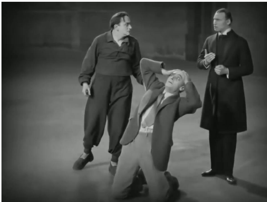
(Joh Fredersen—flanked by his former secretary Josaphat and enforcer Slim—realizes that his actions may cost him his son)