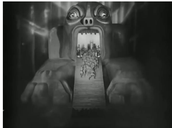
(The centerpiece of the machine chamber is the Heart Machine' located in a large and elevated structure that resembles a ziggurat. Freder is shaken and starts hallucinating about Moloch, the Canaanite god associated with child sacrifice)