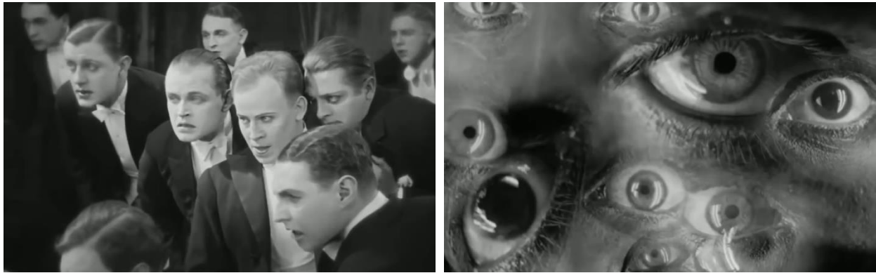
(Machine-human impostor of Maria provokes the workers to destroy the city and she seduces the upper city's men at Club Yoshiwara)