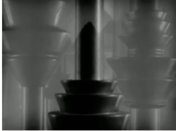
(Metropolis is a bustling modern city with sophisticated architecture and transport systems; cogwheels in revolution and blades spinning. The dynamic turbine looks like an admirable metal sculpture—it is the driving force of the vibrant city)