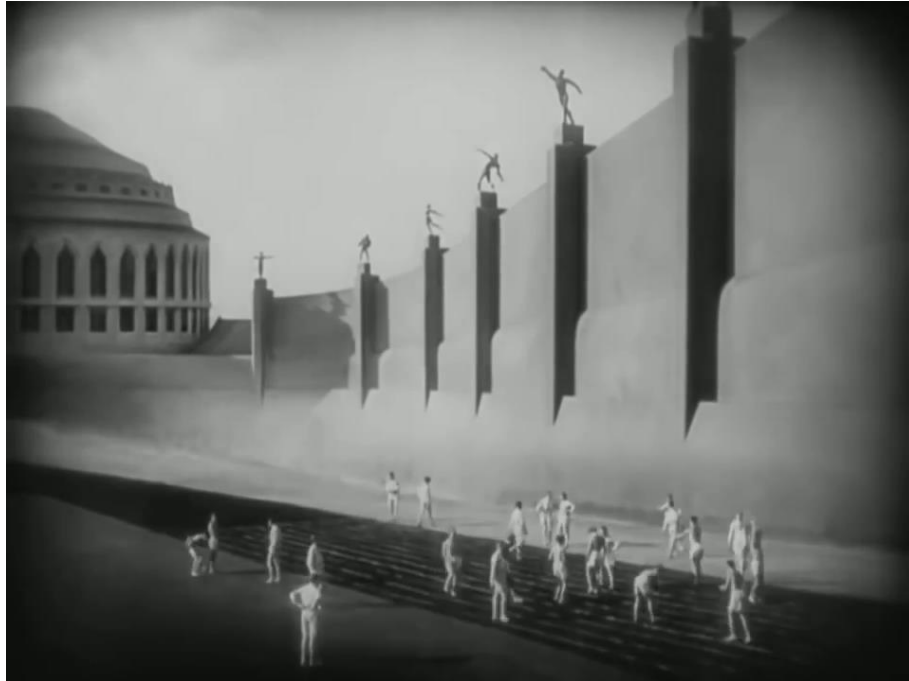
(The City of Sons, the humungous sports arena of Metropolis)