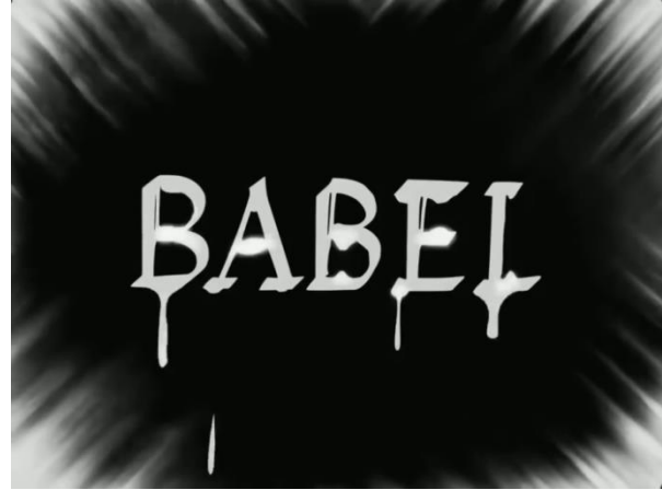
(In Maria's recounting of the tale of Babel, rebellion ends up destroying the tower. The brief sequence does not depict violence but implies it with an intertitle showing blood dripping from the word Babel)