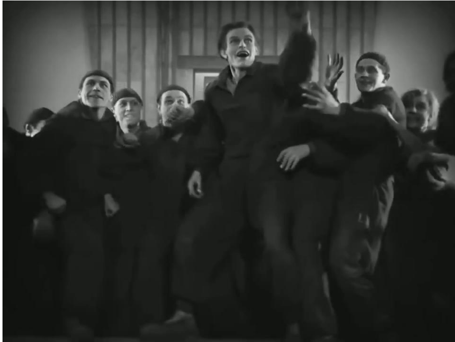
(Workers rebel—for a moment they are jubilant and truly joyful)