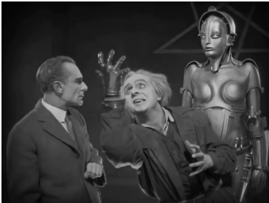
(Rotwang has lost his hand creating the machine-human, but he feels his creation is worth it. Fredersen asks him to redesign the robot in the likeness of Maria—the beloved of the workers as well as Freder. Rotwang is delighted—he predicts that his scheme will cost his archrival his city and his son)