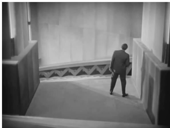
(After getting fired by Fredersen, Josaphat staggers and attempts to kill himself)