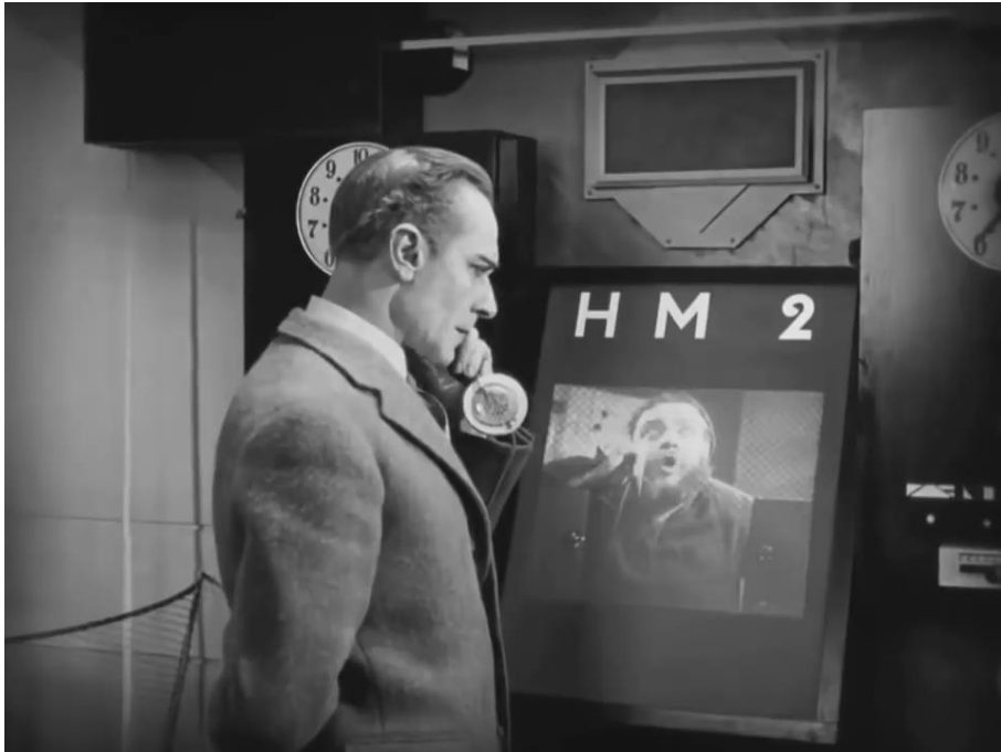
(Fredersen communicates with the foreman Grot using an intercom phone and television screen)