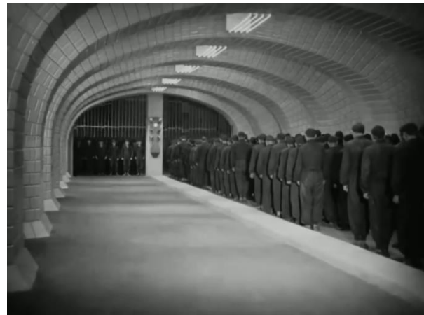
(Joh Fredersen, the ruler of Metropolis; the workers at the end of their shift)