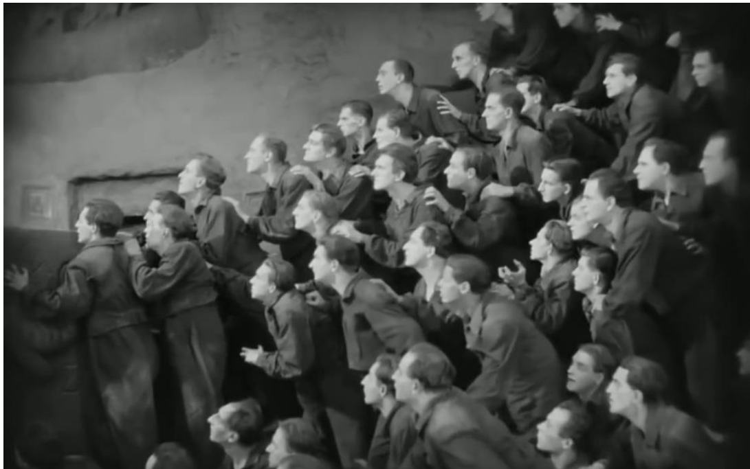
(Maria's oratory grips the workers and gives them hope)