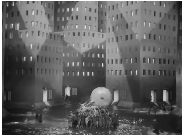
("Let's watch the world go to the devil"—the false Maria leads the elites who continue the party in the streets; Metropolis' children cluster around the real Maria as the destruction of machines causes a flood)