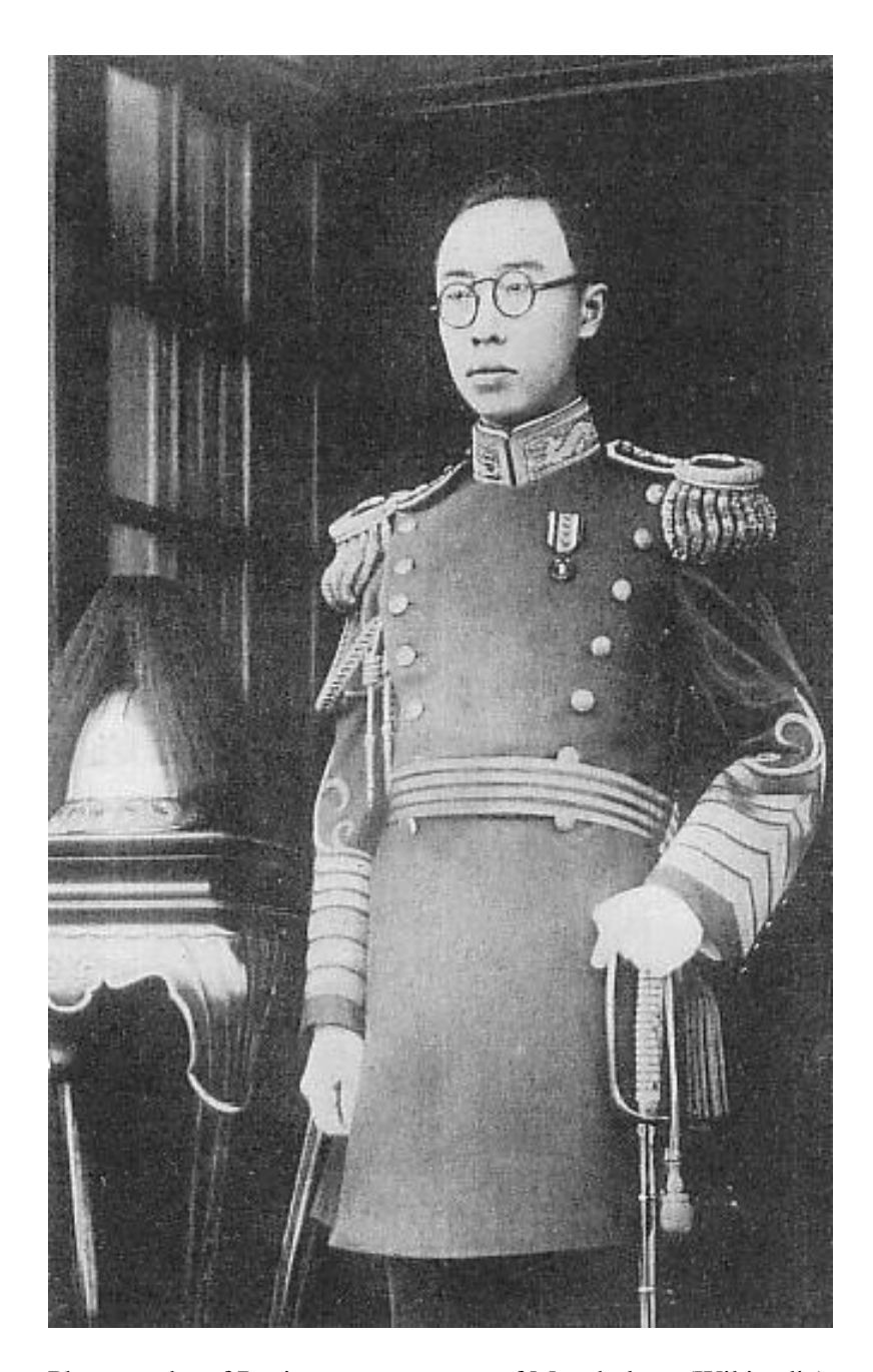
Photography of Puyi, puppet emperor of Manchukuo