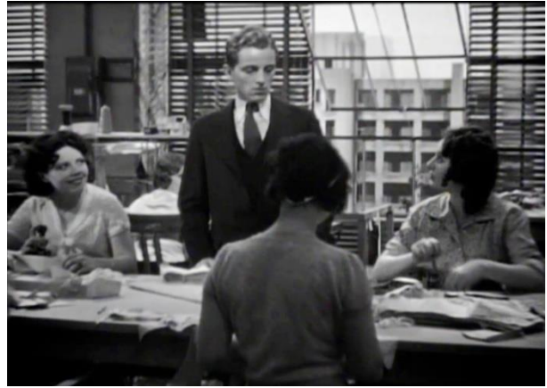
In the Depression-era setting, Clyde drifts in and out of menial jobs – Eventually Clyde secures employment at his uncle's collar factory and supervises collar stamping—the extras were real sewers.