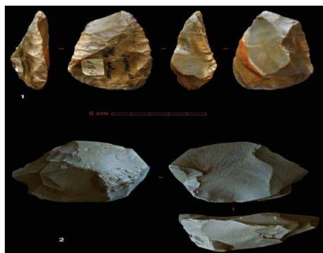
Pic.2 Knives found in the Paleolithic site in the territory of the Komi Republic, near the village Byzovaya ii

Neanderthals were tool makers, but their tools, such as knives made of stone and some bone tools, are very primitive in their techniques. (see pic. 2).