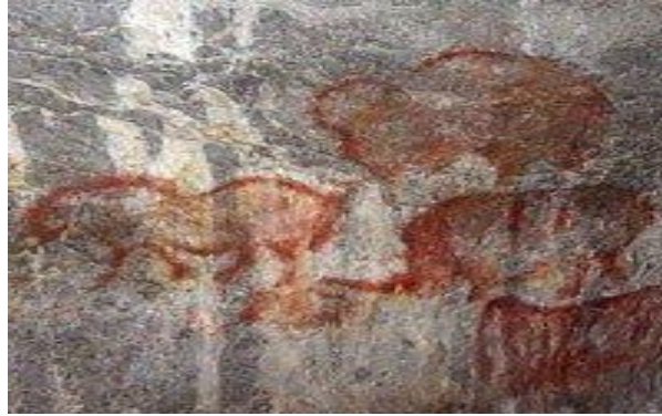
Pic. 4 Red-Ochre Painting of Mammoths (12,500 BCE) Hall of Drawings Kapova Cave v

The more complex techniques used by the hunters in this period indicate more complex forms of social organization. Evidence has also been found that goods were being traded via extensive networks, providing these early people with new methods of coping with the harsh climatic conditions they faced.