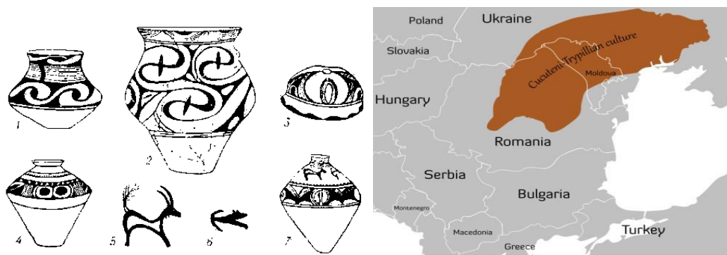
Pic. 5 Trypillian culture vi

In the Eastern European plains the oldest farming culture, the Cucuteni-Trypillian developed. This culture extended from the Carpathian Mountains to the Dniester and Dnieper regions, centered on modern-day Moldova and covered western Ukraine and northeastern Romania.