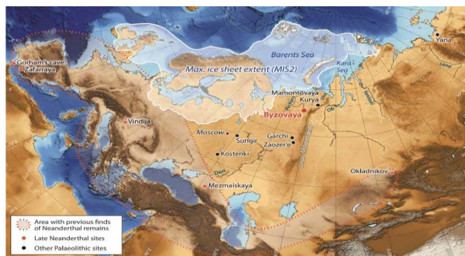
Pic. 1 Mezmaiskaya Cave, a Neanderthal occupation in the southern Russian Republic of Adygea, in the North Caucasus i

Hunting provided the Neanderthals with most of their food, and they hunted a variety of species. Bones found at Neanderthal sites indicates that they hunted mammoth, deer and bison. It is very likely that their diet was supplemented by gathering edible wild plants.