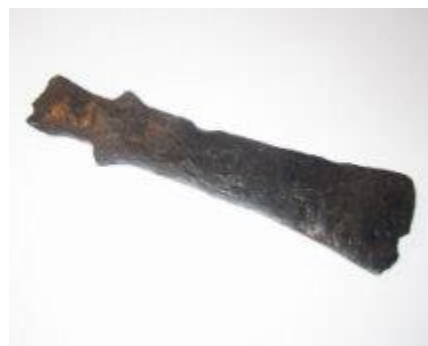
Pic. 7 Cimmerian Tethered Axe Sagaris Iron Age Battle-Axe c.700 BCE from Russia viii

The development of iron tools had a profound impact on almost all aspects of society, including trade, crafts and agriculture. In the early Iron Age the practice of nomadic pastoralism became widespread across the steppes of Eurasia. However, the need to follow their herds and disputes over pastureland led to increasing conflict among nomadic peoples. These conflicts stimulated the formation of large-scale alliances between tribes, and the appearance of the earliest states. As a result, both small, fortified urban centers even true